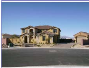
Ref #: 903336

Bedrooms: 3 PropSubType: Single Family Residential Baths: 2 / 1 / 1 Subdivision: CIMARRON HIGHLANDS SqFt: 5,812 # Garages: 4 / Auto Door Opener(s) # Carports: 0 Lot SqFt: 22,651 Pool Desc: N Faces: East Spa Desc: N Status: ER Year Built: 2008