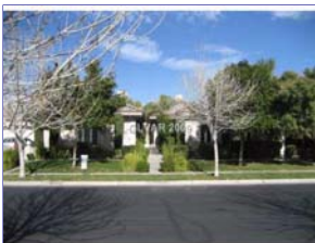
Ref #: 981388

Bedrooms: 4 PropSubType: Single Family Residential Baths: 3 / 0 / 1 Subdivision: ANTHEM CNTRY CLUB PARCEL 12 SqFt: 3,848 # Garages: 3 / Attached # Carports: 0 Lot SqFt: 8,712 Pool Desc: Y / Heated Pool Status: ER Faces: West Spa Desc: Y Year Built: 2004