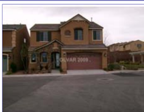
Ref #: 907472

Bedrooms: 3 PropSubType: Single Family Residential Baths: 2 / 0 / 1 Subdivision: MONTICELLO AT CLIFFS EDGE-UNIT SqFt: 2,310 # Garages: 2 / Attached # Carports: 0 Lot SqFt: 2,614 Pool Desc: N Status: ER Faces: East Spa Desc: N Year Built: 2008