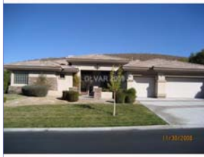
Ref #: 996172