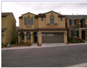
Ref #: 907491

Bedrooms: 6 PropSubType: Single Family Residential Baths: 3 / 1 / 0 Subdivision: MONTEREY EST SqFt: 3,828 # Garages: 3 / Attached # Carports: 0 Lot SqFt: 21,361 Pool Desc: Y / Inground-Priv: Status: ER Faces: North Spa Desc: Y / Inground Year Built: 1994