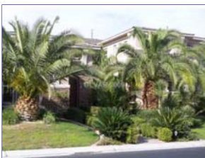
Ref #: 991001

Bedrooms: 4 PropSubType: Single Family Residential Baths: 1 / 1 / 1 Subdivision: GREEN VALLEY RANCH SqFt: 3,625 # Garages: 3 / Attached # Carports: 0 Lot SqFt: 12,081 Pool Desc: N Status: ER Faces: South Spa Desc: N Year Built: 2001