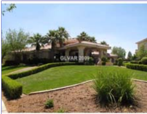
Ref #: 989235

Bedrooms: 5 PropSubType: Single Family Residential Baths: 2 / 3 / 2 Subdivision: STAR CANYON SqFt: 9,054 # Garages: 4 / Storage Area/Shelves # Carports: 0 Lot SqFt: 41,428 Pool Desc: Y / Inground-Priv: Status: ER Faces: South Spa Desc: Y / Indoor Year Built: 2000