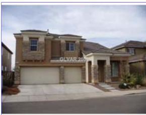
Ref #: 949488

Bedrooms: 5 PropSubType: Single Family Residential Baths: 3 / 0 / 0 Subdivision: SUNRIDGE SUMMIT HGTS SqFt: 2,550 # Garages: 3 / Attached # Carports: 0 Lot SqFt: 11,761 Pool Desc: N Status: ER Faces: North Spa Desc: N Year Built: 2006