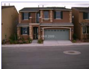
Ref #: 907482

Bedrooms: 4 PropSubType: Single Family Residential Baths: 2 / 0 / 1 Subdivision: MONTICELLO AT CLIFFS EDGE-UNIT SqFt: 2,443 # Garages: 2 / Attached # Carports: 0 Lot SqFt: 2,178 Pool Desc: N Status: ER Faces: East Spa Desc: N Year Built: 2008