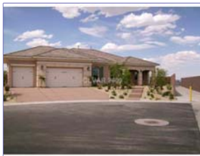
Ref #: 903370

Bedrooms: 3 PropSubType: Single Family Residential Baths: 2 / 0 / 1 Subdivision: CIMARRON HIGHLANDS SqFt: 3,274 # Garages: 3 / Attached # Carports: 0 Lot SqFt: 20,473 Pool Desc: N Faces: East Spa Desc: N Status: ER Year Built: 2008