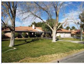
Ref #: 905859

Bedrooms: 4 PropSubType: Single Family Residential Baths: 3 / 0 / 1 Subdivision: MOUNTAINS EDGE RIVENDELL- PHAS SqFt: 3,269 # Garages: 3 / Attached # Carports: 0 Lot SqFt: 16,988 Pool Desc: N Status: ER Faces: West Spa Desc: N Year Built: 2007