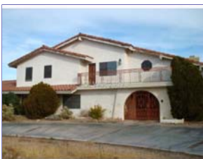
Ref #: 994359

Bedrooms: 5 PropSubType: Single Family Residential Baths: 3 / 0 / 1 Subdivision: Custom SqFt: 3,383 # Garages: 5 / Attached # Carports: 0 Lot SqFt: 21,000 Pool Desc: Y / Inground-Priv: Status: ER Faces: North Spa Desc: N Year Built: 1988