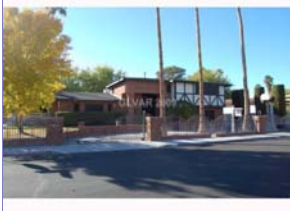
Ref #: 994811