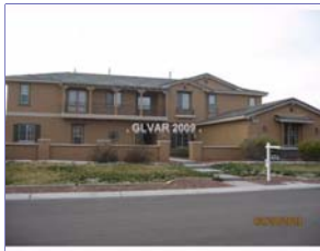
Ref #: 999635