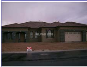
Ref #: 903307

Bedrooms: 6 PropSubType: Single Family Residential Baths: 4 / 0 / 0 Subdivision: CIMARRON HIGHLANDS SqFt: 4,477 # Garages: 5 / Attached # Carports: 0 Lot SqFt: 27,443 Pool Desc: N Faces: South Spa Desc: N Status: ER Year Built: 2008