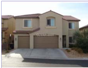
Ref #: 998315

Bedrooms: 5 PropSubType: Single Family Residential Baths: 4 / 0 / 1 Subdivision: PROVENCE SUB 7 SqFt: 3,347 # Garages: 2 / Attached # Carports: 0 Lot SqFt: 14,375 Pool Desc: N Faces: South Spa Desc: N Status: ER Year Built: 2007