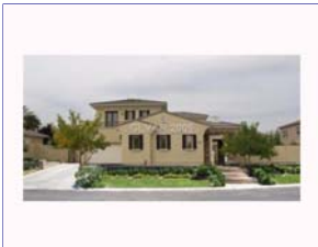
Ref #: 969682

Bedrooms: 4 PropSubType: Single Family Residential Baths: 4 / 0 / 1 Subdivision: TOURNAMENT HILLS SqFt: 5,480 # Garages: 4 / Auto Door Opener(s) # Carports: 0 Lot SqFt: 26,162 Pool Desc: Y / Beach Entry Status: ER Faces: North Spa Desc: Y Year Built: 1997