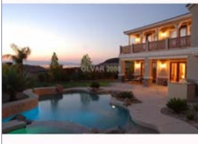
Ref #: 843713