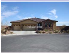
Ref #: 980167

Bedrooms: 4 PropSubType: Single Family Residential Baths: 4 / 0 / 1 Subdivision: WINDHAM HILLS UNIT 3 SqFt: 4,427 # Garages: 3 / Attached # Carports: 0 Lot SqFt: 16,988 Pool Desc: N Status: ER Faces: North Spa Desc: N Year Built: 2006