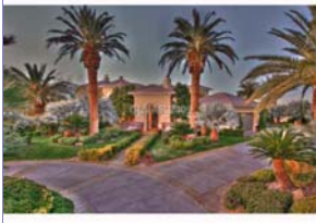
Ref #: 902302