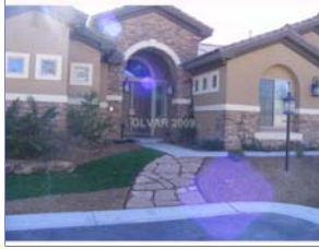
Ref #: 999364