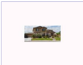
Ref #: 950632

Bedrooms: 5 PropSubType: Single Family Residential Baths: 3 / 0 / 1 Subdivision: GRAND TETON JONES N E 40 AC SI SqFt: 4,024 # Garages: 3 / Auto Door Opener(s) # Carports: 0 Lot SqFt: 20,473 Pool Desc: Y / Automatic Cov Faces: South Spa Desc: N Status: ER Year Built: 2004