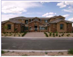
Ref #: 903351