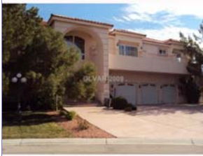
Ref #: 994147

Bedrooms: 4 PropSubType: Single Family Residential Baths: 1 / 3 / 1 Subdivision: RED ROCK CNTRY CLUB AT SUMMERL SqFt: 4,899 # Garages: 3 / Attached # Carports: 0 Lot SqFt: 11,871 Pool Desc: Y / Inground-Priv: Status: ER Faces: East Spa Desc: Y / Inground Year Built: 2001