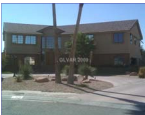
Ref #: 968440

Bedrooms: 5 PropSubType: Single Family Residential Baths: 5 / 1 / 1 Subdivision: MOUNTAIN SHADOWS 3 SqFt: 6,645 # Garages: 3 / Auto Door Opener(s) # Carports: 0 Lot SqFt: 23,020 Pool Desc: Y / Inground-Priv: Status: ER Faces: West Spa Desc: Y / Inground Year Built: 1998