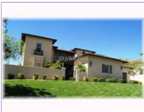
Ref #: 831452

Bedrooms: 4 PropSubType: Single Family Residential Baths: 4 / 0 / 1 Subdivision: STAR CANYON SqFt: 4,767 # Garages: 4 / Auto Door Opener(s) # Carports: 0 Lot SqFt: 17,860 Pool Desc: N Status: ER Faces: South Spa Desc: N Year Built: 2005