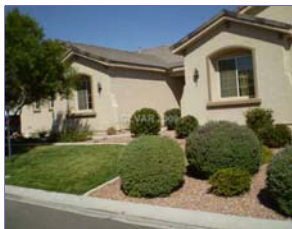
Ref #: 974861

Bedrooms: 5 PropSubType: Single Family Residential Baths: 4 / 0 / 1 Subdivision: BELLA VISTA-UNIT 3 SqFt: 4,608 # Garages: 3 / Attached # Carports: 0 Lot SqFt: 20,038 Pool Desc: Y / Pool/Spa Com Faces: East Spa Desc: Y Status: ER Year Built: 2005