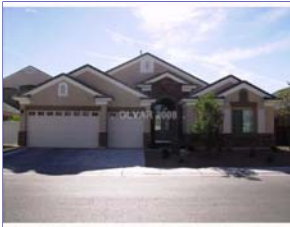
Ref #: 862288