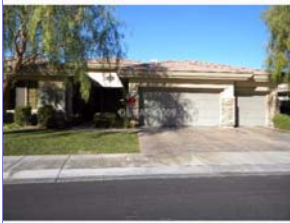
Ref #: 999095

Bedrooms: 5 PropSubType: Single Family Residential Baths: 5 / 0 / 1 Subdivision: FOOTHILLS AT MACDONALD RANCH P SqFt: 5,037 # Garages: 3 / Attached # Carports: 0 Lot SqFt: 12,632 Pool Desc: Y / Inground-Priv: Status: ER Faces: East Spa Desc: Y Year Built: 2006