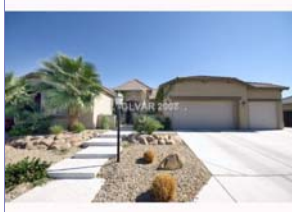
Ref #: 867897

Bedrooms: 5 PropSubType: Single Family Residential Baths: 2 / 1 / 0 Subdivision: ELKHORN JONES SqFt: 4,028 # Garages: 3 / Attached # Carports: 0 Lot SqFt: 12,632 Pool Desc: N Faces: North Spa Desc: N Status: ER Year Built: 2005