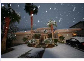
Ref #: 970873

Bedrooms: 5 PropSubType: Single Family Residential Baths: 1 / 2 / 1 Subdivision: MASON MANOR SqFt: 3,535 # Garages: 0 # Carports: 0 Lot SqFt: 10,920 Pool Desc: Y / Heated Pool Status: ER Faces: North Spa Desc: Y / Inground Year Built: 1964