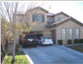
Ref #: 996046

Bedrooms: 5 PropSubType: Single Family Residential Baths: 4 / 0 / 1 Subdivision: ANTHEM CNTRY CLUB PARCEL 8 SqFt: 4,511 # Garages: 3 / Attached # Carports: 0 Lot SqFt: 14,933 Pool Desc: N Status: ER Faces: East Spa Desc: N Year Built: 2001