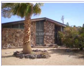
Ref #: 979099

Bedrooms: 4 PropSubType: Single Family Residential Baths: 1 / 3 / 0 Subdivision: EQUESTRIAN EST SUB SqFt: 3,828 # Garages: 3 / Attached # Carports: 0 Lot SqFt: 21,590 Pool Desc: Y / Inground-Priv: Status: ER Faces: South Spa Desc: Y / Inground Year Built: 1977