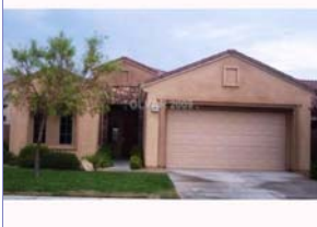
Ref #: 815316