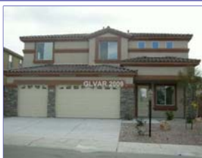
Ref #: 955352

Bedrooms: 4 PropSubType: Single Family Residential Baths: 4 / 0 / 0 Subdivision: SEVEN HILLS SqFt: 2,985 # Garages: 3 / Attached # Carports: 0 Lot SqFt: 5,823 Pool Desc: Y / Pool/Spa Com Faces: East Spa Desc: Y / Inground Status: ER Year Built: 1999