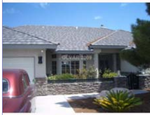
Ref #: 963060