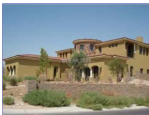
Ref #: 968933

Bedrooms: 3 PropSubType: Single Family Residential Baths: 2 / 0 / 1 Subdivision: CIMARRON HIGHLANDS SqFt: 3,274 # Garages: 3 / Attached # Carports: 0 Lot SqFt: 21,344 Pool Desc: N Faces: East Spa Desc: N Status: ER Year Built: 2008