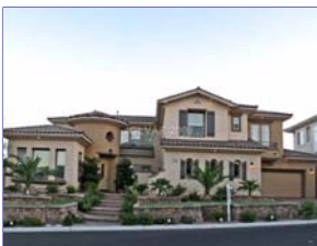
Ref #: 959183

Bedrooms: 4 PropSubType: Single Family Residential Baths: 3 / 0 / 1 Subdivision: VINEYARDS UNIT 3 SqFt: 4,199 # Garages: 3 / Attached # Carports: 0 Lot SqFt: 11,658 Pool Desc: Y / Inground-Priv: Status: ER Faces: North Spa Desc: Y / Inground Year Built: 2001