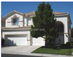
Ref #: 995595

Bedrooms: 5 PropSubType: Single Family Residential Baths: 3 / 0 / 1 Subdivision: PROVENCE SUB 5 SqFt: 3,800 # Garages: 3 / Attached # Carports: 0 Lot SqFt: 5,663 Pool Desc: Y / Inground-Priv: Faces: East Spa Desc: N Status: ER Year Built: 2007