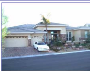
Ref #: 999508

Bedrooms: 4 PropSubType: Single Family Residential Baths: 3 / 0 / 1 Subdivision: BELLA VISTA-UNIT 1 SqFt: 3,996 # Garages: 4 / Attached # Carports: 0 Lot SqFt: 21,344 Pool Desc: N Faces: North Spa Desc: N Status: ER Year Built: 2004