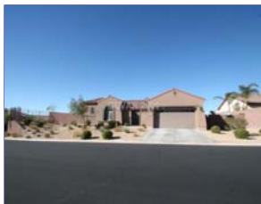
Ref #: 988136

Bedrooms: 3 PropSubType: Single Family Residential Baths: 2 / 0 / 1 Subdivision: ANTHEM CNTRY CLUB PARCEL 8 SqFt: 3,085 # Garages: 3 / Attached # Carports: 0 Lot SqFt: 16,601 Pool Desc: N Faces: West Spa Desc: N / Inground Status: ER Year Built: 2001