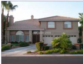
Ref #: 873754

Bedrooms: 4 PropSubType: Single Family Residential Baths: 2 / 1 / 0 Subdivision: DESERT VIEW EST SUB SqFt: 2,991 # Garages: 3 / Attached # Carports: 0 Lot SqFt: 19,221 Pool Desc: N Status: ER Faces: West Spa Desc: N Year Built: 1993